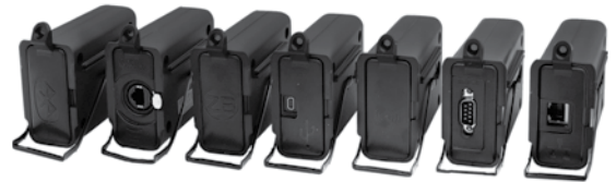
Modules: Bluetooth, DMM, ZigBee, USB, Wifi, RS232, Ethernet

The GRX Battery Diagnostic Station is designed to offer an often required level of service around the world, using switch-mode and a more scalable platform to help customize the GRX to fit any OEM or aftermarket battery management program.