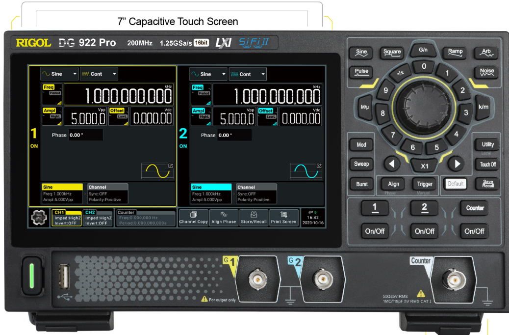
7" Capacitive Touch Screen