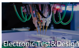
Electronic Test & Design