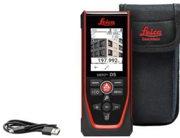
Leica DISTO™ D5 Art. No. 950908

Leica DISTO™ D5, Pouch, USB-C to USB-A Cable, Hand Loop, Quick Start Guide, Warranty card, Safety Manual, Calibration Certificate Silver