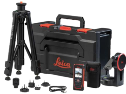
Leica DISTO™ D5 Package Art. No. 950879

Leica DISTO™ D5, Pouch, USB-C to USB-A Cable, Hand Loop, Quick Start Guide, Warranty card, Safety Manual, Calibration Certificate Silver