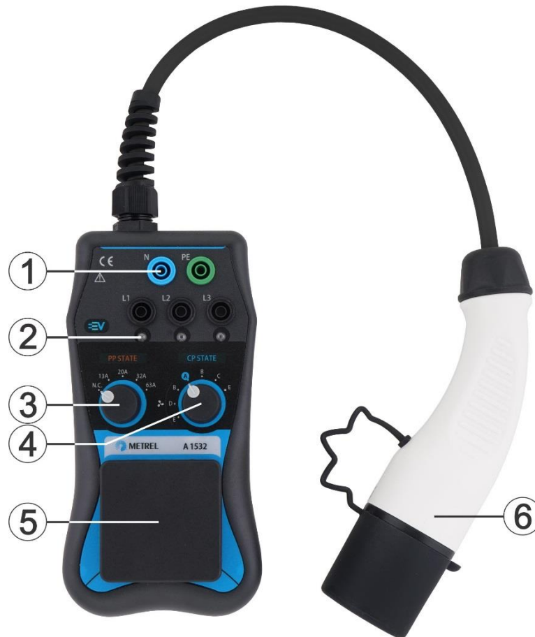
Figure 3.1: A 1532 components